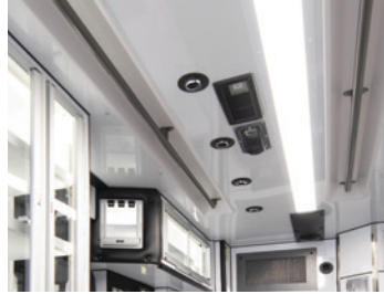
'X' SERIES DUAL RECESSED GRAB RAILS, CEILING & CABINET LIGHTING