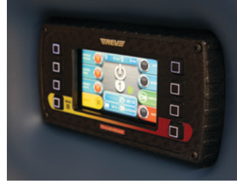
LX-1 SWITCH PANEL