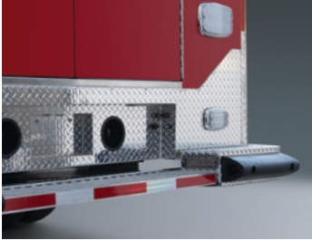
'X' SERIES BUMPER & KICKPLATE